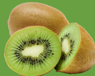
Zespri Green Kiwi